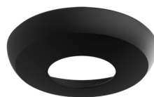
Cover ring PD3N FM Art.No: 93087

Dimensions: Ø 200 x 90 mm Impact strength: IK09 Housing: coated steel basket