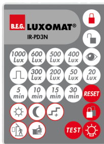
IR-PD3N Art.No: 92105

Battery: 3.0 V Lithium CR2032 (inclusive) Dimensions: 80 x 60 x 8 mm Material color: -