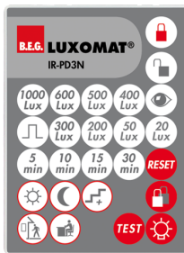
IR-PD3N Art.No: 92105

Battery: 3.0 V Lithium CR2032 (inclusive) Dimensions: 80 x 60 x 8 mm Material color: -