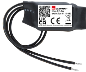
Mini-RC-Arc extinction kit Art.No: 10882

Voltage: 230 V AC \pm 10\% Dimensions: 38 x 12 x 26 mm Degree / class of protection: IP20 / Class II