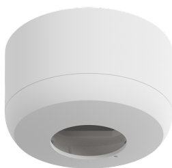
SM socle mounting set IP54 PD2N H Art.No: 93782

Voltage: 110 – 240 V AC 50 / 60 Hz Dimensions: Ø 82 x 86 mm Power consumption: approx. 0.2 W