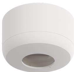
SM socle mounting set IP54 PD2N H Art.No: 93454

Voltage: 110 – 240 V AC 50 / 60 Hz Dimensions: Ø 82 x 86 mm Power consumption: approx. 0.2 W