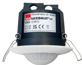
PD2N-RF-KNXs-DX-FC Art.No: 93580

To receive the bundle according to the technical specification, please order the items listed.