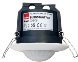
PD2N-RF-KNXs-DX-FC Art.No: 93580

To receive the bundle according to the technical specification, please order the items listed.