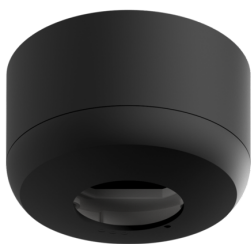
SM socle mounting set IP54 PD2N H Art.No: 93783

Voltage: 230 V AC \pm 10\% 50 Hz Dimensions: \varnothing 84 \times 85 mm Power consumption: approx. 3 W