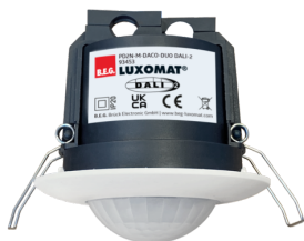
PD2N-M-DACO-DUO DALI-2 Art.No: 93453

To receive the bundle according to the technical specification, please order the items listed.