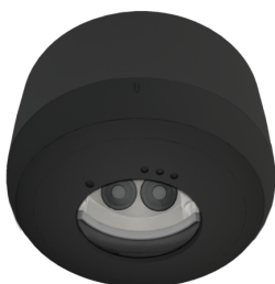
SM socle mounting set IP54 PD2N H Art.No: 93783

Voltage: 230 V AC \pm 10\% 50 Hz Dimensions: \varnothing 84 \times 85 mm Power consumption: approx. 2 W