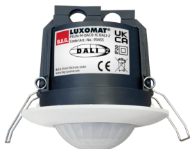
PD2N-M-DACO-1C DALI-2 Art.No: 93455

To receive the bundle according to the technical specification, please order the items listed.