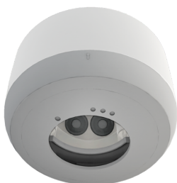
SM socle mounting set IP54 PD2N H Art.No: 93782

Voltage: 230 V AC \pm 10% 50 Hz Dimensions: \varnothing 84 x 85 mm Power consumption: approx. 2 W