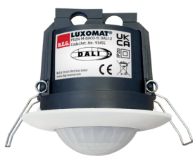
PD2N-M-DACO-1C DALI-2 Art.No: 93455

To receive the bundle according to the technical specification, please order the items listed.