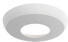
Cover ring PD2N FM Art.No: 93760

Voltage: via KNX BUS Dimensions: Ø 106 x 42 mm Typ. power input: 12 mA