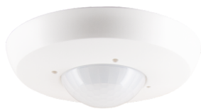
PD2N-KNXs-OCCULOG-DX-FM Art.No: 93531

To receive the bundle according to the technical specification, please order the items listed.