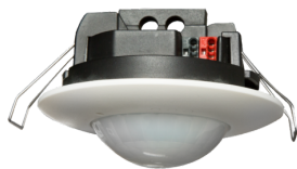
PD2N-KNXs-BA-FC Art.No: 93533

To receive the bundle according to the technical specification, please order the items listed.