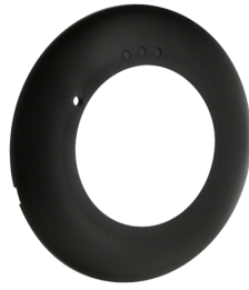
Cover ring PD2N FC Art.No: 93773

Battery: 3.0 V Lithium CR2032 (inclusive) Dimensions: 80 x 60 x 8 mm Material color: -