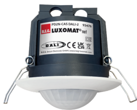
PD2N-CAS DALI-2 Art.No: 93476

To receive the bundle according to the technical specification, please order the items listed.