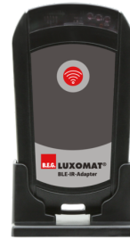
BLE-IR-Adapter Art.No: 93067

Voltage: 230 V AC \pm 10\% Dimensions: 50 x 23 x 8 mm Degree / class of protection: IP20 / Class II