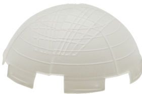
Blinds PD2-SM Art.No: 92260

Dimensions: Ø 200 x 90 mm Impact strength: IK09 Housing: coated steel basket