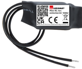
Mini-RC-Arc extinction kit Art.No: 10882

Voltage: 230 V AC \pm 10\% Dimensions: 38 x 12 x 26 mm Degree / class of protection: IP20 / Class II