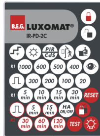
IR-PD-2C Art.No: 92475

Dimensions: 40 x 55 x 103 mm Material color: black Frequency: 2.4 GHz ISM band, GFSK 0.2 dBm + 5.3 dBi = 5.5 dBm