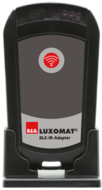
BLE-IR-Adapter Art.No: 93067

Dimensions: 40 x 55 x 103 mm Material color: black Frequency: 2.4 GHz ISM band, GFSK 0.2 dBm + 5.3 dBi = 5.5 dBm