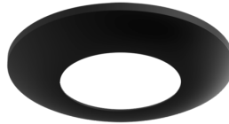
Cover ring PD2/PD3 FC Art.No: 93085

Battery: 3.0 V Lithium CR2032 (inclusive) Dimensions: 80 x 60 x 8 mm Material color: -