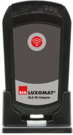
BLE-IR-Adapter Art.No: 93067

Dimensions: 40 x 55 x 103 mm Material color: black Frequency: 2.4 GHz ISM band, GFSK 0.2 dBm + 5.3 dBi = 5.5 dBm