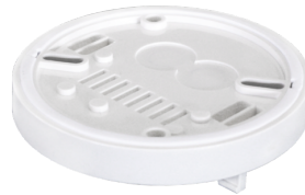
SM socket IP54 for PD2- / PD4-SM Art.No: 92161

Battery: 3.0 V Lithium CR2032 (inclusive) Dimensions: 80 x 60 x 8 mm Material color: -