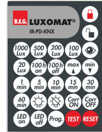
IR-PD-KNX Art.No: 92123

Dimensions: 47 x 19 x 10 mm Degree / class of protection: IP20 Ambient temperature: -20 °C to +40 °C