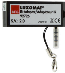
IR-Adapter for Smartphones Art.No: 92726

Dimensions: Ø 200 x 90 mm Impact strength: IK09 Housing: coated steel basket