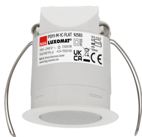
PD11-M-1C-FLAT-FC Art.No: 92583

To receive the bundle according to the technical specification, please order the items listed.