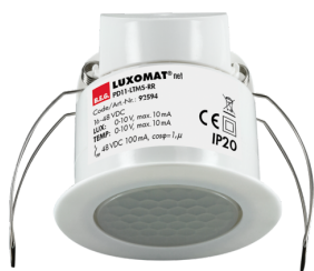
PD11-LTMS-RR-FC Art.No: 92594

To receive the bundle according to the technical specification, please order the items listed.