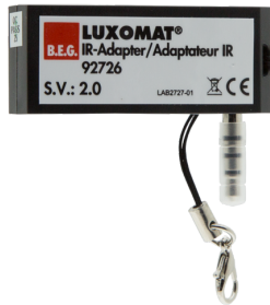
IR-Adapter for Smartphones Art.No: 92726

Dimensions: 40 x 55 x 103 mm Material color: black Frequency: 2.4 GHz ISM band, GFSK 0.2 dBm + 5.3 dBi = 5.5 dBm