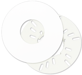
In-wall mounting set / PD11 Art.No: 92833

Dimensions: 40 x 55 x 103 mm Material color: black Frequency: 2.4 GHz ISM band, GFSK 0.2 dBm + 5.3 dBi = 5.5 dBm