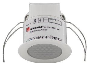
PD11-KNXs-FLAT-DX-FC Art.No: 93523

To receive the bundle according to the technical specification, please order the items listed.