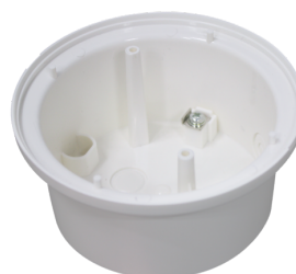
Surface mounting socket PD11 Art.No: 92121

Dimensions: Ø 104 mm Material color: white