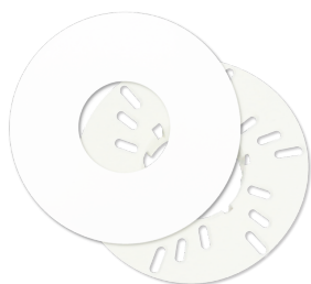
In-wall mounting set / PD11 Art.No: 92833

Voltage: via KNX BUS Dimensions: Ø 52 x 48 mm Typ. power input: 12 mA