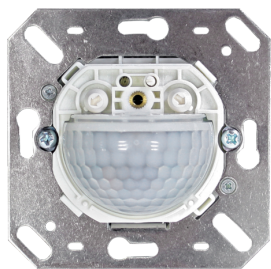
Indoor 180-R-11-48V-RR covering not included Art.No: 92667

To receive the bundle according to the technical specification, please order the items listed.