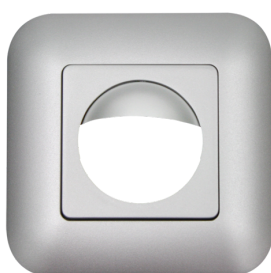
Frame IP20 Indoor 180 Art.No: 92633

Voltage: 110 – 240 V AC 50 / 60 Hz Dimensions: covering included 87 x 87 x 61 mm Power consumption: approx. 0.4 W