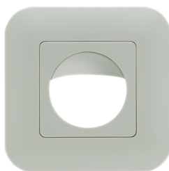
Frame IP20 Indoor 180 Art.No: 92631

Voltage: 110 – 240 V AC 50 / 60 Hz Dimensions: covering included 87 x 87 x 61 mm Power consumption: approx. 0.4 W