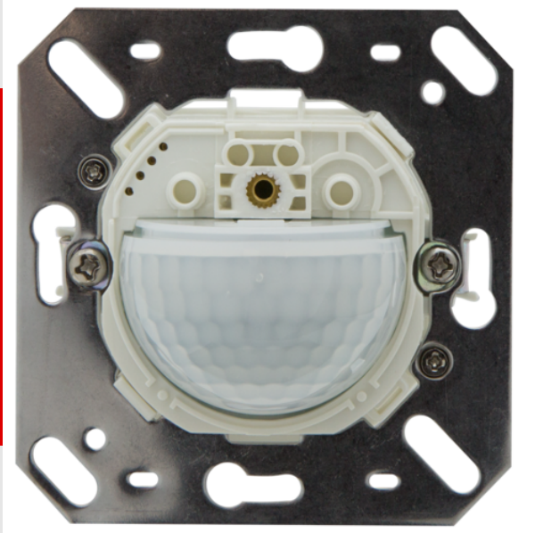
KNX PIR Wall-Mounted Motion Detector (Standard) with 180° detection angle and a range of up to 10 m (150 m 2 )