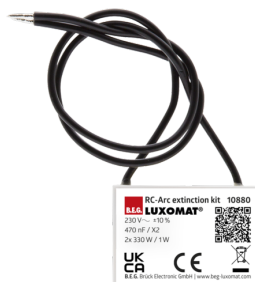
RC-Arc extinction kit Art.No: 10880

Dimensions: Ø 200 x 90 mm Impact strength: IK09 Housing: coated steel basket