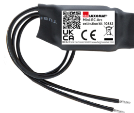
Mini-RC-Arc extinction kit Art.No: 10882

Voltage: 230 V AC \pm 10\% Dimensions: 38 x 12 x 26 mm Degree / class of protection: IP20 / Class II