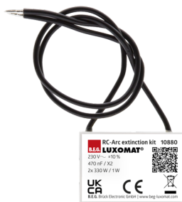
RC-Arc extinction kit Art.No: 10880

Dimensions: Ø 200 x 90 mm Impact strength: IK09 Housing: coated steel basket