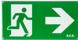
Pictogram DT32-LED right arrow Art.No: 8858

Dimensions: 170 x 330 x 1 mm Housing: Plastic Material color: green