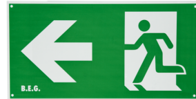
Pictogram DT32-LED left arrow Art.No: 8859

Dimensions: 170 x 330 x 1 mm Housing: Plastic Material color: green