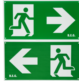
Pictogram two-sided/right-left Art.No: 8860

Dimensions: 47 x 19 x 10 mm Degree / class of protection: IP20 Ambient temperature: -20 °C to +40 °C