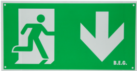
Pictogram DT32-LED down arrow Art.No: 8785

Dimensions: 170 x 330 x 1 mm Housing: Plastic Material color: green