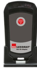
BLE-IR-Adapter Art.No: 93067

Voltage: 230 V AC \pm 10\% Dimensions: 50 x 23 x 8 mm Degree / class of protection: IP20 / Class II