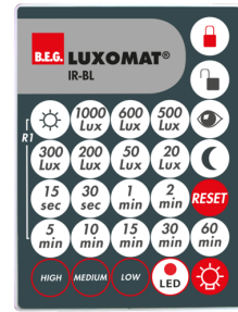
IR-BL Art.No: 93055

Voltage: 230 V AC \pm 10\% Dimensions: 50 x 23 x 8 mm Degree / class of protection: IP20 / Class II