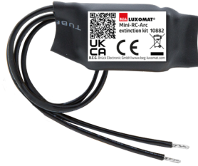
Mini-RC-Arc extinction kit Art.No: 10882

Voltage: 230 V AC \pm 10\% Dimensions: 38 x 12 x 26 mm Degree / class of protection: IP20 / Class II