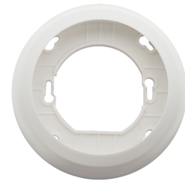
Mounting set BL2-FM Art.No: 93251

Dimensions: \varnothing 109 x 50 mm Degree / class of protection: IP23 Material color: white