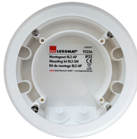
Mounting set BL2-SM Art.No: 93256

Dimensions: 40 x 55 x 103 mm Material color: black Frequency: 2.4 GHz ISM band, GFSK 0.2 dBm + 5.3 dBi = 5.5 dBm