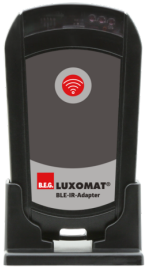
BLE-IR-Adapter Art.No: 93067

Battery: 3.0 V Lithium CR2032 (inclusive) Dimensions: 80 x 60 x 8 mm Housing: polycarbonate, UV-resistant