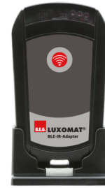
BLE-IR-Adapter Art.No: 93067

Voltage: 230 V AC \pm 10\% Dimensions: 50 x 23 x 8 mm Degree / class of protection: IP20 / Class II