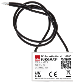
RC-Arc extinction kit Art.No: 10880

Voltage: 230 V AC \pm 10\% Dimensions: 38 x 12 x 26 mm Degree / class of protection: IP20 / Class II