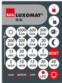
IR-BL Art.No: 93055

Dimensions: 40 x 55 x 103 mm Material color: black Frequency: 2.4 GHz ISM band, GFSK 0.2 dBm + 5.3 dBi = 5.5 dBm