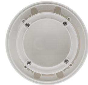
Mounting set BL4-SM Art.No: 93183

Dimensions: Ø 200 x 90 mm Impact strength: IK09 Housing: coated steel basket