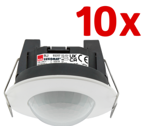
10 x BL2-FC Art.No: 93327

To receive the bundle according to the technical specification, please order the items listed.