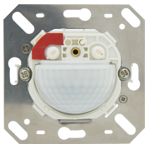
Indoor 180-R-11-48V-3A covering not included Art.No: 92666

To receive the bundle according to the technical specification, please order the items listed.