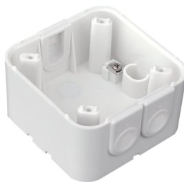
Surface mounting socket Indoor 180 Art.No: 92141