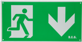
Pictogram DT32-LED down arrow Art.No: 8785

Dimensions: 170 x 330 x 1 mm Housing: Plastic Material color: green