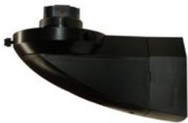
black , Art.-Nr.: 91345