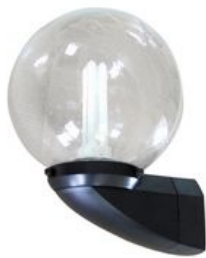
white , Art.-Nr.: 91335